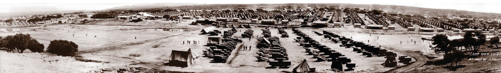
CAMP ORD, CALIF. 1941.

▼ Motor pool a few yards south of Inter-Garrison Road, East Garrison area, circa 1941