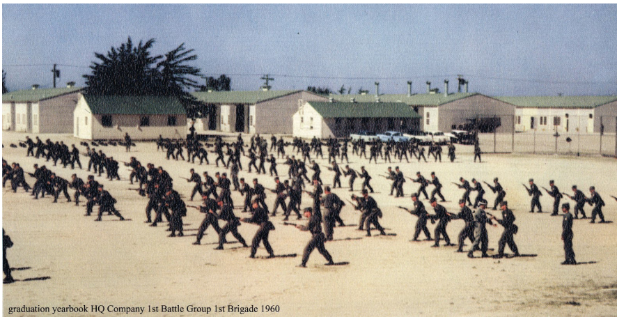
graduation yearbook HQ Company 1st Battle Group 1st Brigade 1960

Today, you'll still find pieces of Fort Ord's military past across campus -- in murals, in renovated buildings, and even in new buildings like the Alumni & Visitors Center (the lobby ceiling is made of wood recycled from demolished Army barracks). You'll also find the wisdom and creativity of the founders in the faculty and in the curriculum. You'll enjoy traditional events such as Earth Week and hangouts like the BBC, started up by pioneer alumni. And you'll have a chance to weave your own story into ours, and become a part of our history as it unfolds.