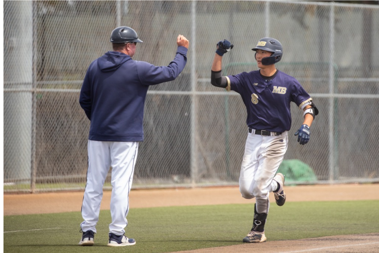
Named 2023 Collegiate Sports Communicators (CSC) Academic All-American ® National Collegiate Baseball Writer's Association (NCBWA) All-American, American Baseball Coaches Association (ABCA) All-West Region and All-CCAA First Team