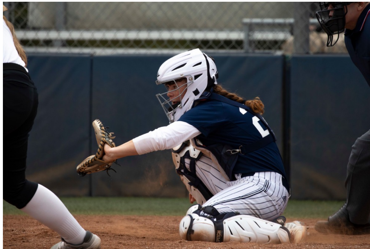
NCAA Division II Rawlings Gold Glove Award winner as selected by the National Fastpitch Coaches Association. Led the Otters in average (.363), hits (65), 2Bs (17) and home runs (9) as a freshman