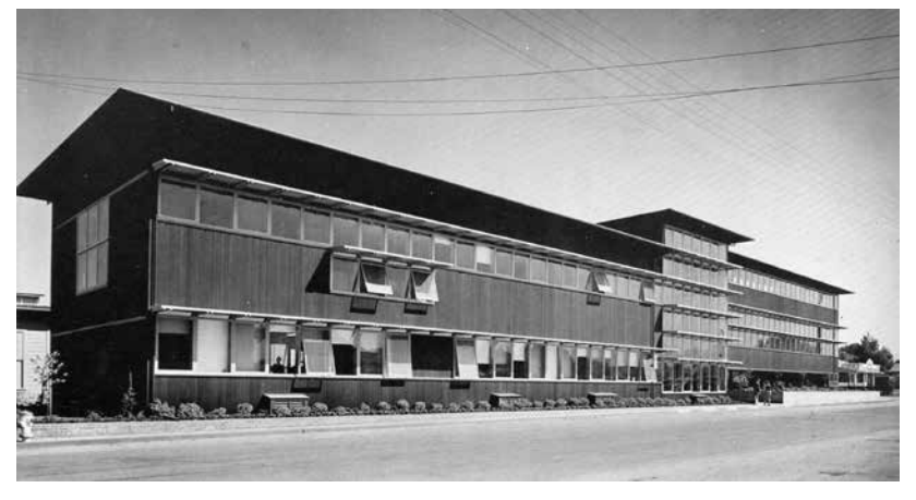
The Bay Area Rustic Style (upper left) is exemplified by use of rugged, local materials, and a combination of themes arranged to form a cohesive composition. The Monterey Customs House (upper right) is an example of Monterey vernacular architecture, with its long gable red-tiled roof, cantilevered second floor porch, and whitewashed adobe walls. Bay Area Modernism (lower) features minimal forms, modern techniques and a traditional feeling for natural materials.