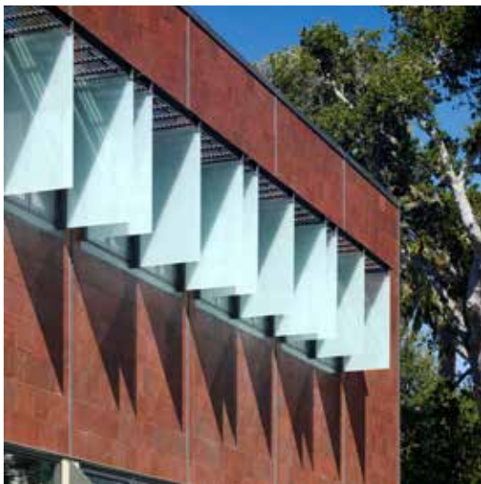
South exposures should be articulated to control solar gain (upper). East and west-facing windows may require vertical solar shading (lower).