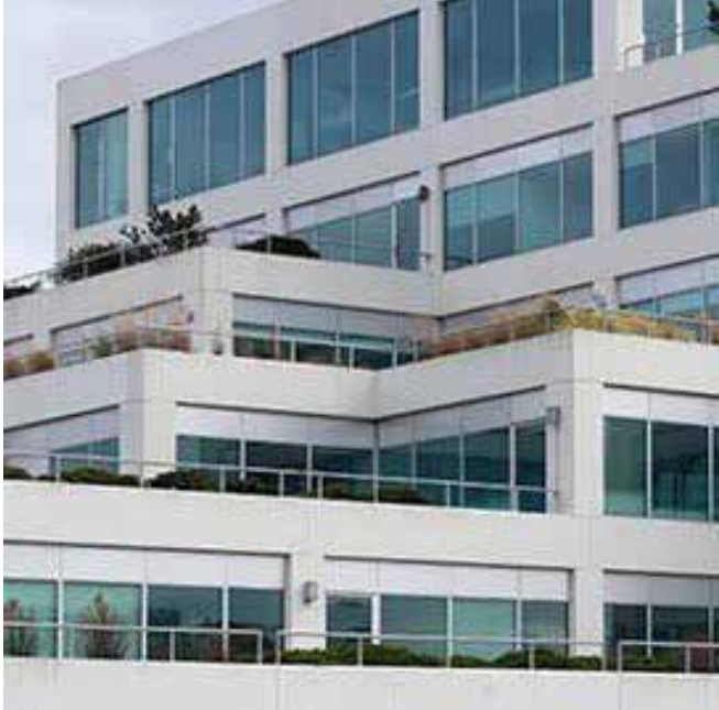
Building facade treatments reflecting different interior uses (upper). Articulated facades facing open space (lower).