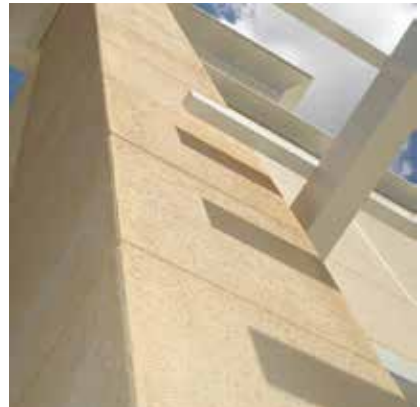
Use of natural stone enhances building color and texture (above left and right).