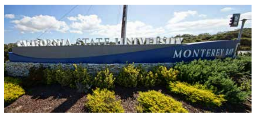
Monument signage such at the CSUMB sign at General Jim Moore Boulevard and Lightfighter Drive announce the entrance to campus. Monument signage should be integrated into a gateway landscape at the four campus gateways.