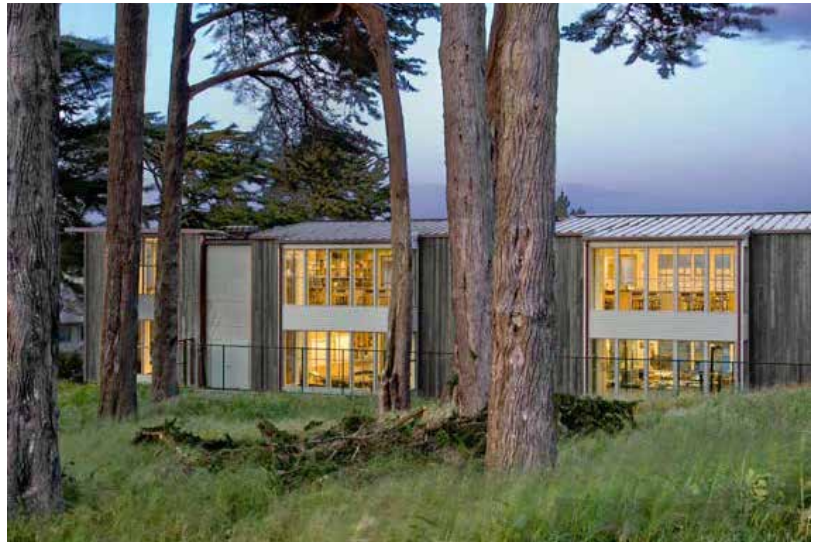
Building forms providing interaction with the environment (upper); building siting responsive to landform and landscape (lower).