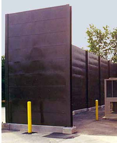
Design service docks and loading areas in keeping with building envelope (left). Screen service areas from view and isolate to mitigate noise with physical barriers including landscape (right).