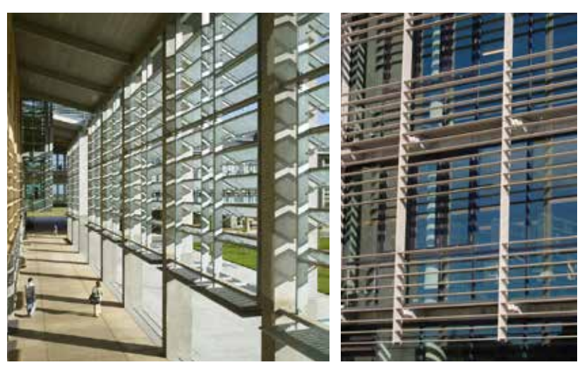
Building envelope, including the use of sun shades, modulates ventilation and solar gain.