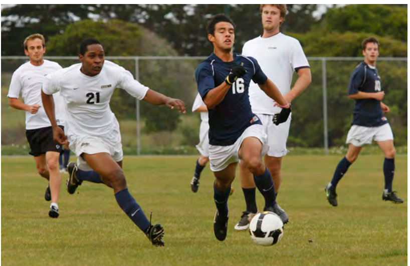
The Athletics and Recreation District will become a cohesive district, with upgrades to existing and additional new facilities for both the Athletics and Recreation programs.