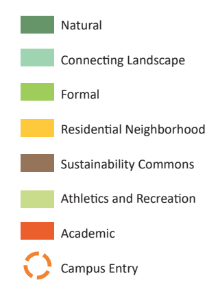
Figure 6.2: Open Space Types