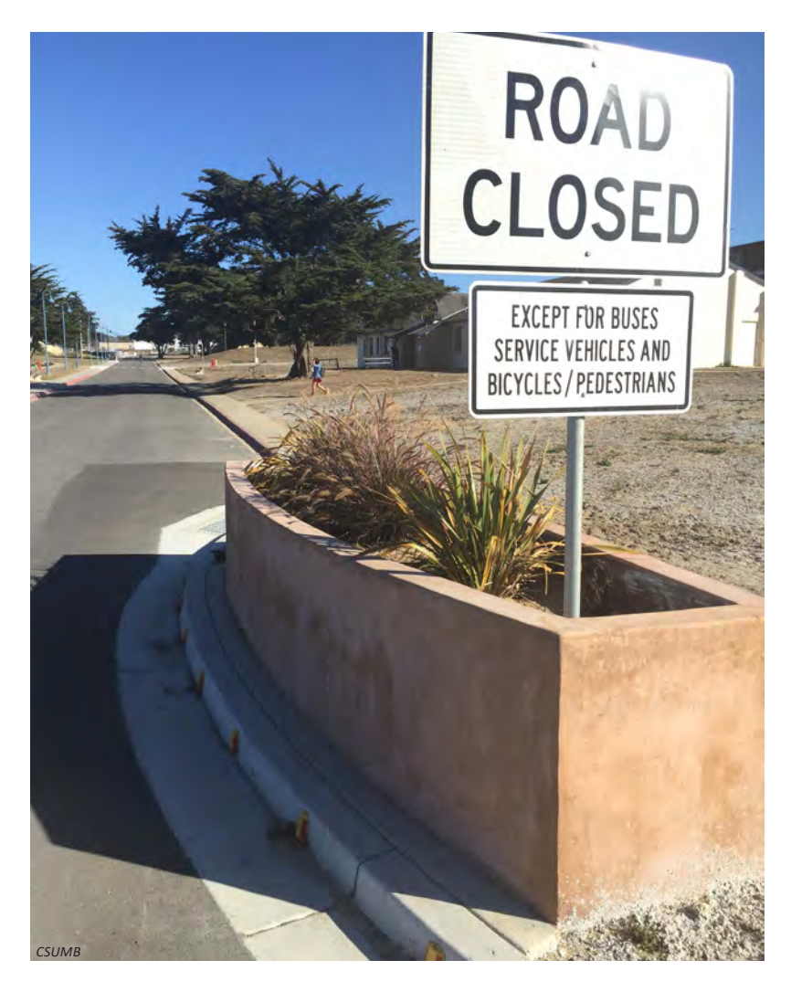
Divarty Mall will become a pedestrian mall, with some similar traits, such as special paving, as the closed portion of Sixth Avenue (above).

Residential open spaces contribute to the quality and character of the Campus residential neighborhoods, and provide areas for socialization and the informal interactions for students. These vary in size from large spaces for recreation and events to more intimate spaces for small group gathering and studying.