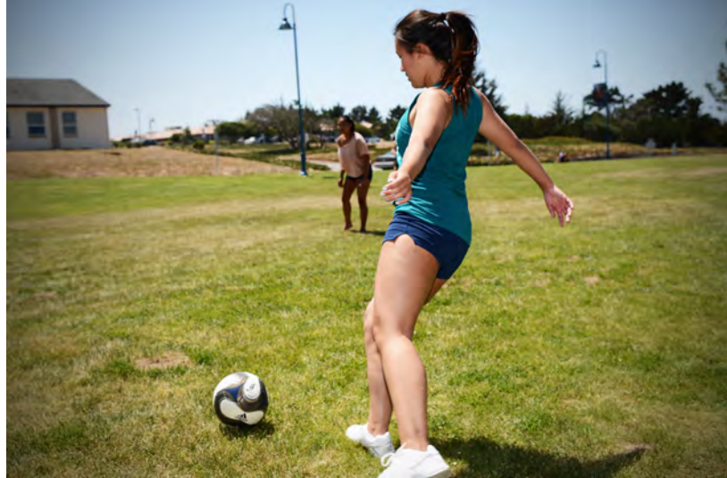
Student residential neighborhoods should have a variety of open spaces, including smaller, intimate spaces with seating (upper), and larger open spaces for informal recreation (lower).