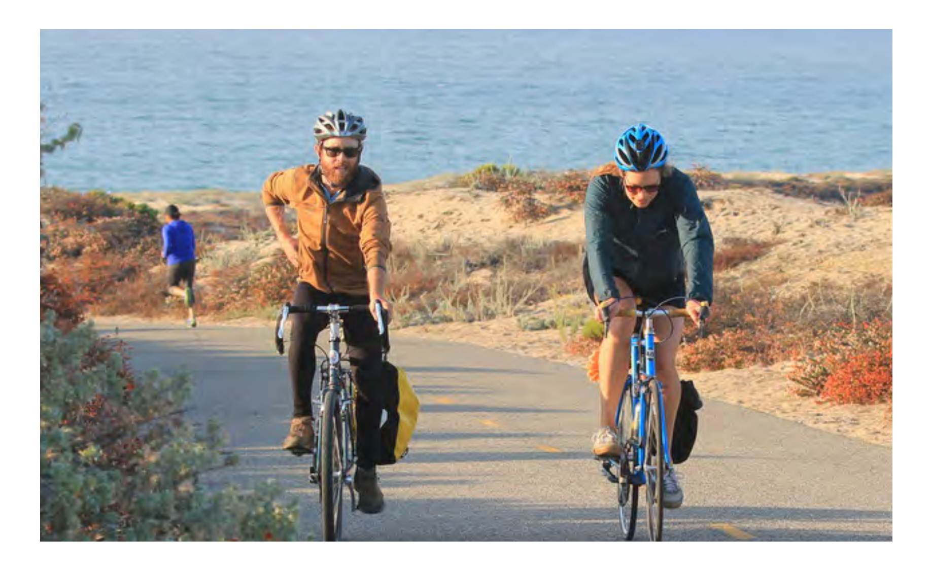
CSUMB should continue to brand itself as an outdoor campus, with access to beautiful natural areas and the Pacific Ocean.