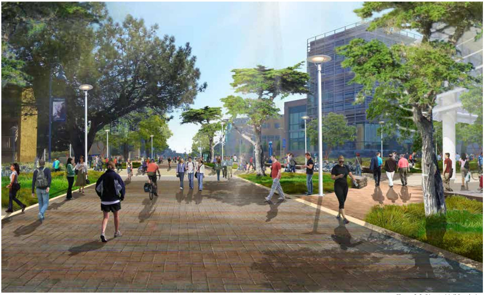
Figure 3.6: Divarty Mall Rendering