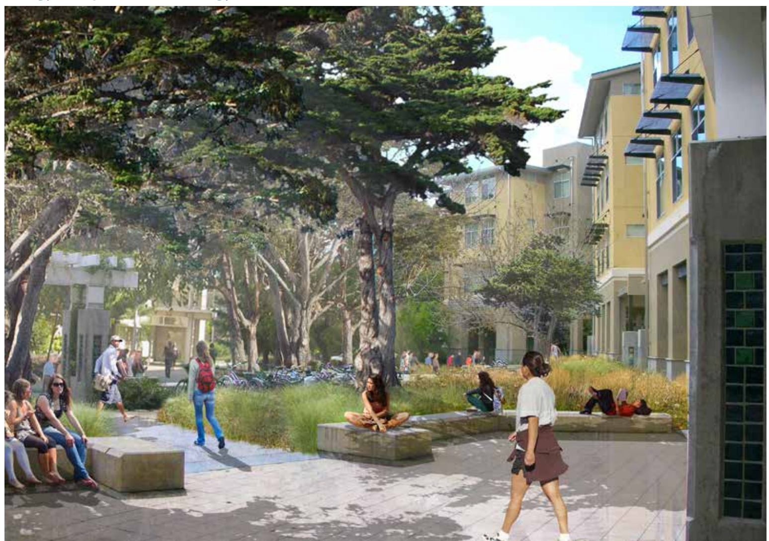
Figure 3.5: Residential Neighborhood Rendering

Water: Respect Scarcity and Manage Run-off & Energy: Adapt with Technology at a District Scale