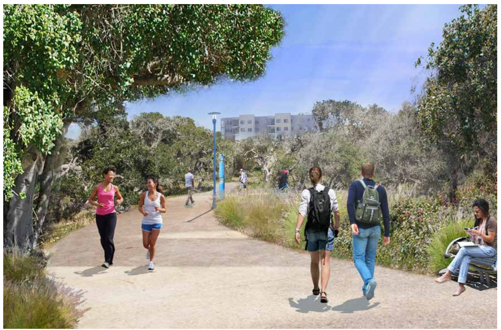
Figure 3.3: Bicycle and Pedestrian Path Rendering