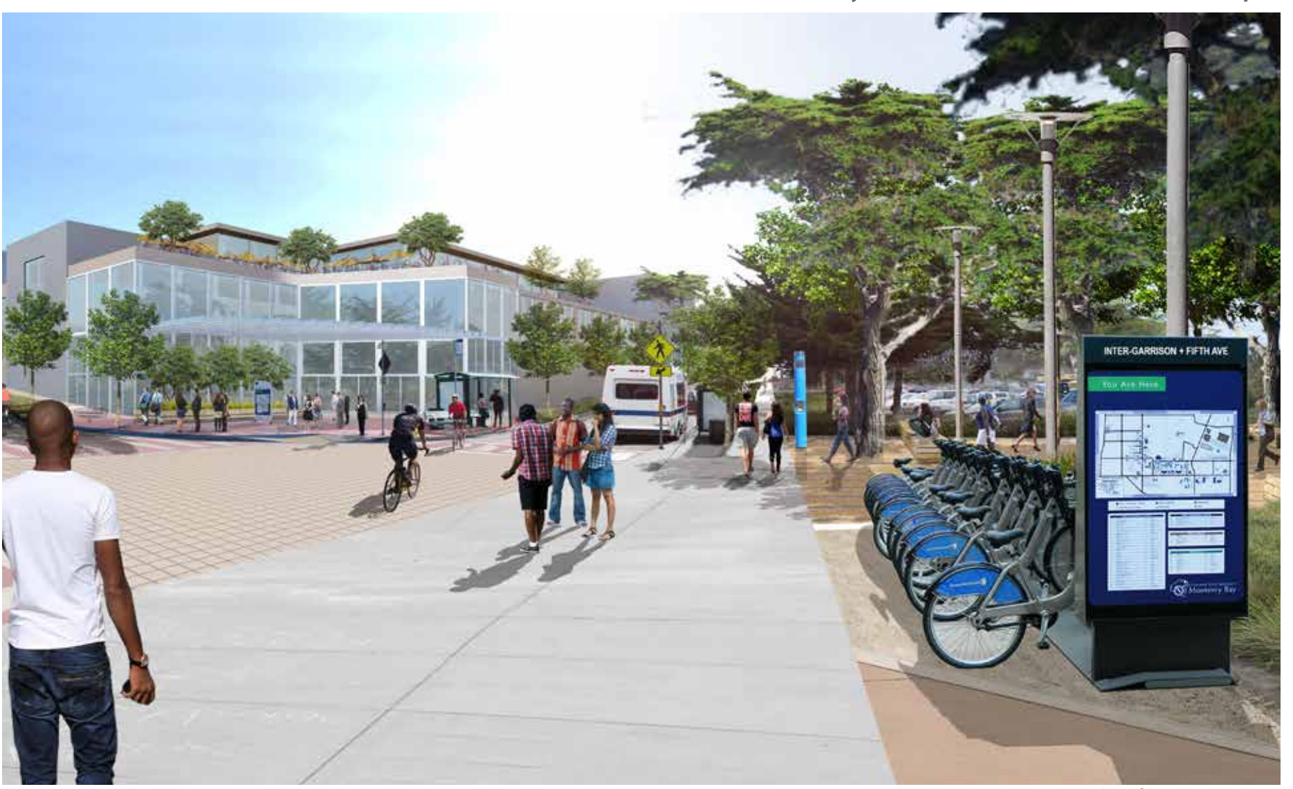
Figure 3.4: Inter-Garrison Road at Fifth Avenue Rendering