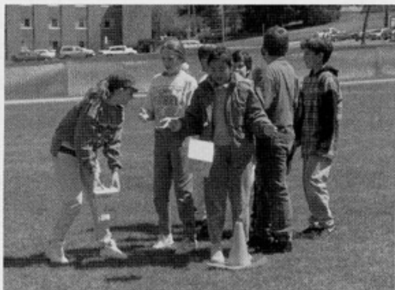
Where will this student go next on water's incredible journey?