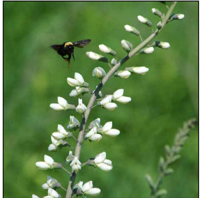
White Wild Indigo, Baptisia alba

The bean family recently was divided into three new families. Botanists split the bean family into three separate families based on different kinds of flowers in the family. Originally the family name, Leguminosae, described the typical fruit of the family—a legume. A legume is a pod with two or more seeds. Legumes fix nitrogen in the soil on account of a symbiotic relationship with bacteria. The bacteria, Rhizobium , attach to nodules on the roots of the plants. The bacteria acquire food from the plant, and in return produce nitrogen. This relationship benefits the entire ecosystem. For example, the biomass of a typical prairie is 4,000 lb./acre, a prairie with a high percentage of legumes will weigh in at 8,000 lb. / acre. That's double the weight!