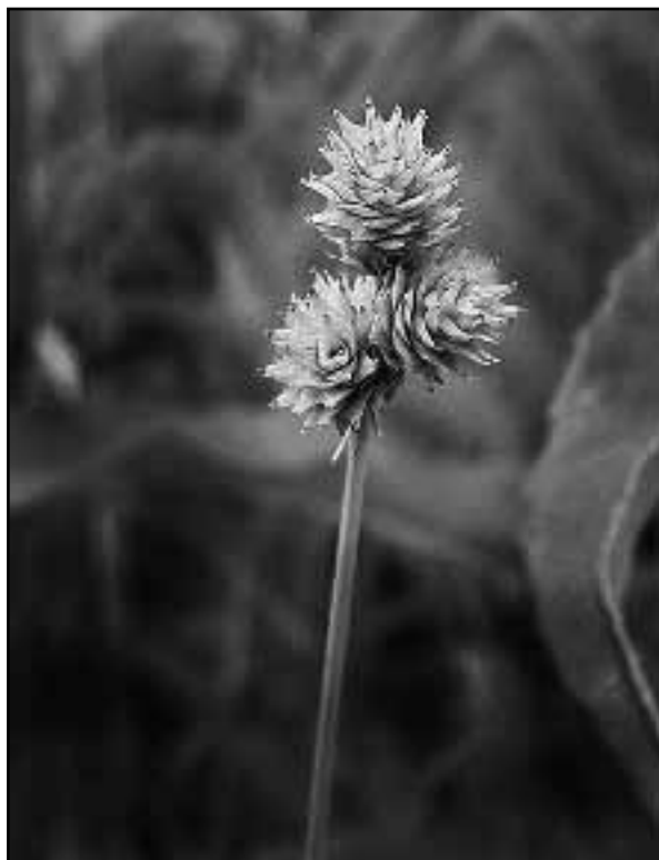
Troublesome Sedge, Carex molesta