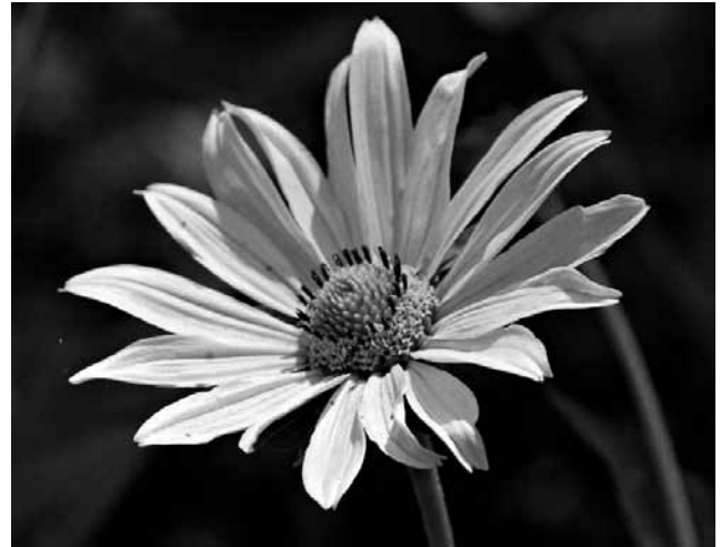
Ox-eye Sunflower, Heliopsis helianthoides