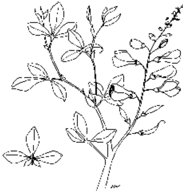
White Wild Indigo, Baptisia alba