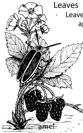
Wild Strawberry, Fragaria virginiana