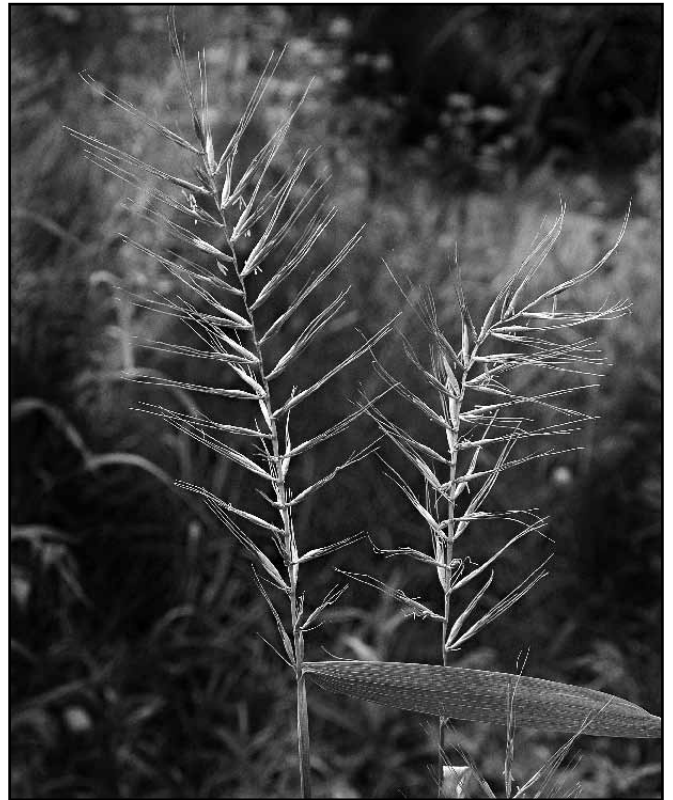
Bottlebrush Grass, Hystrich patula