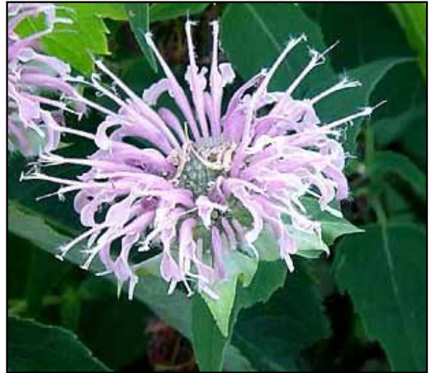
Beebalm, Monarda fistulosa

Labiatae comes from the word lip, which describes the shape of the flower. Mints are aromatic. The odor comes from oil produced in many small glands on the surface of the leaves and stems. Botanists believe aromatic oils deter animals and insects from feeding on the foliage. For humans, the pungent fragrance and flavor is used for making tea, candies and gum, flavoring for food, and air fresheners.