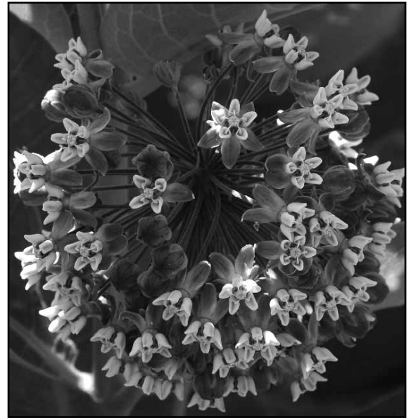
Common Milkweed, Asclepias syriaca

The milkweed family is very large and consists of perennial herbs and climbing shrubs. Members of the family are largely tropical with Africa having the greatest concentration. Simple leaves and a milky juice in the stems and leaves identify milkweeds. This white-colored substance is a bitter tasting, toxic compound that protects the plants from being eaten by most insects. Monarch larva are unaffected by the compounds and actually prefer eating the tissues of these plants. A build up of the toxic compounds in their bodies protects monarchs from predation as larva and adults .