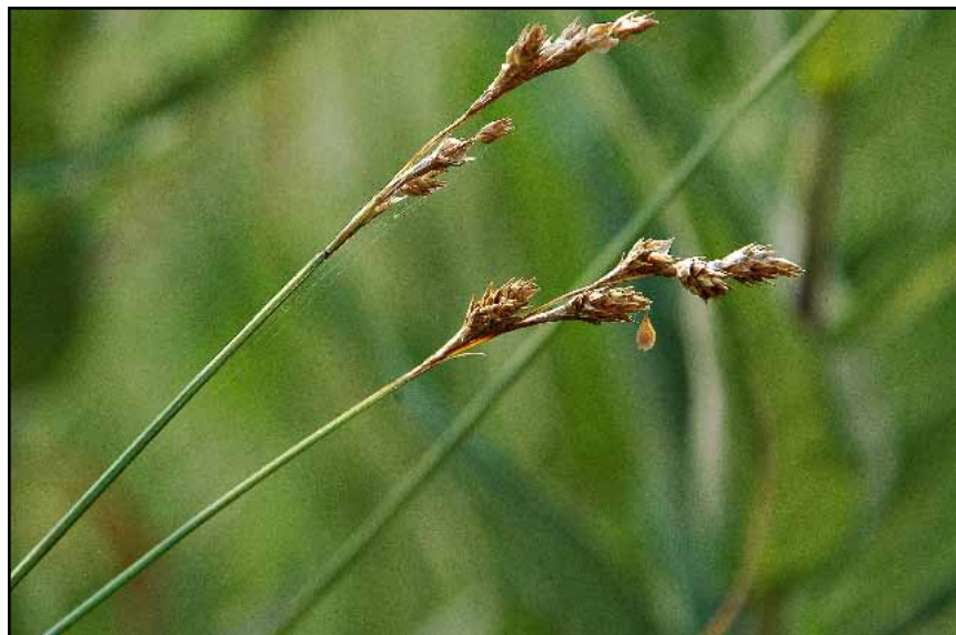
Prairie Sedge, Carex Bicknelli