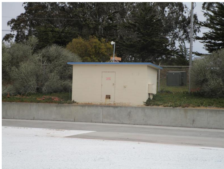
Figure 5. Electrical building, looking east (IMG_0452)