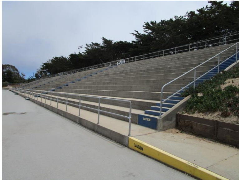
Figure 4. South bleachers, looking southeast (IMG_0434)