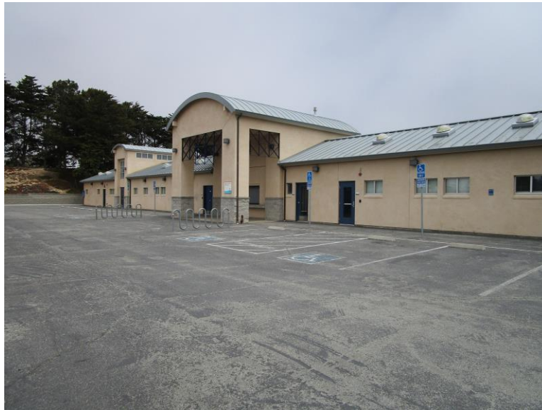
Figure 1. Main (west) elevation, looking northeast (IMG_0431)

Freeman Stadium is located at a low grade, with the bleachers following the slope of the hillside. A chain-link fence encloses the field, track, and bleachers, with gates on the west, near the Field House (Figure 1), and on the east side of the field for ADA accessibility. Deciduous and evergreen trees and shrubs are planted around the perimeter of the chain-link fence.