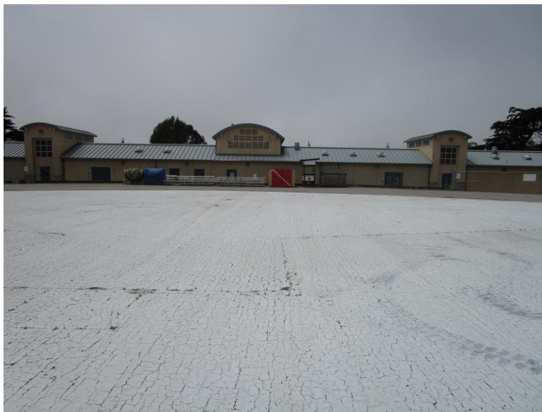
Figure 2. East elevation, looking west (IMG_0477)

Clerestory windows are located on the north and south façade of the barrel roof additions. The building is clad in stucco fiber cement siding and sits on a concrete foundation.