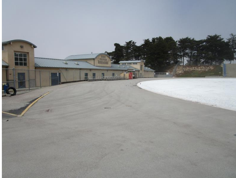
Figure 6. Track detail, looking northwest, Field House in background (IMG_0437)