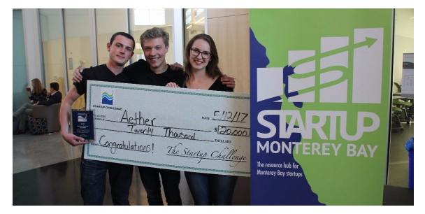
Startup Challenge Monterey Bay 2017 awarded its Venture Division Winner, Aether, a $20,000 cash prize.